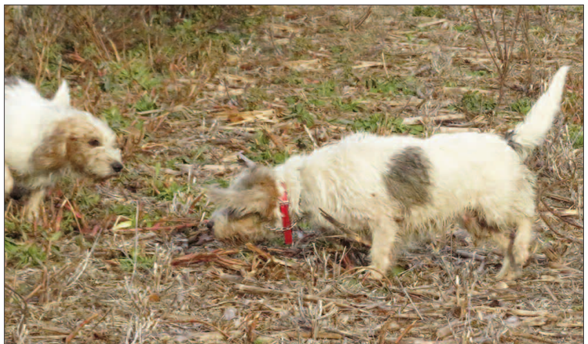
Hallman's—in cry on rabbit 1....