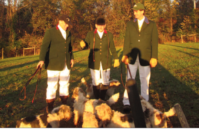
Aldie-hounds in kennels.