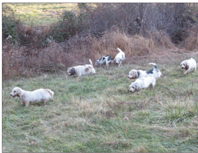
on the line of rabbit 5....