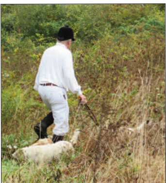
Opening Meet end of day and tea.