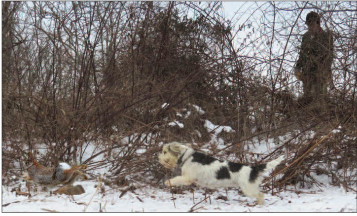
Allerton Farm—moving off.....