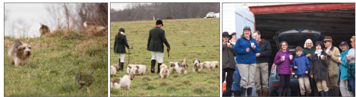
Milky Way Farm—second rabbit!