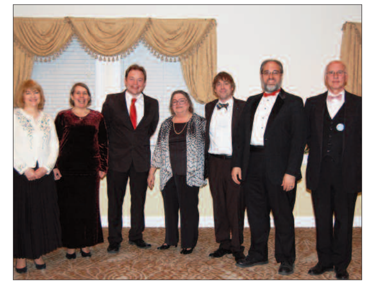
THE SAVOY TRAVELING TROUPE