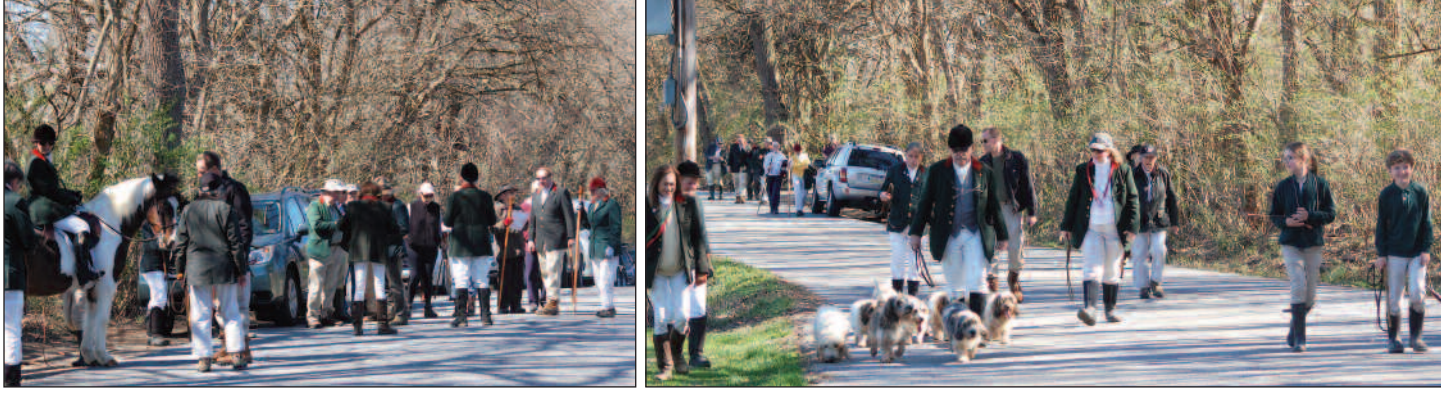
The Closing Meet at Marsh Creek.