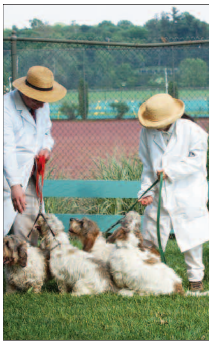
We placed 2nd in the 2 Couples of Hounds Class