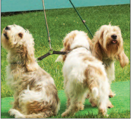
Vicky was 2nd Brood Bitch with Produce BB and Button