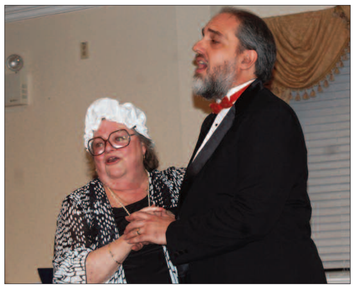
"You have betrayed me" Song from Pirates of Penzance