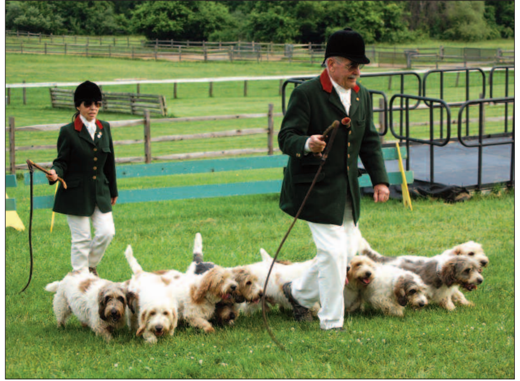
We were Third in the Pack Class of seven packs.