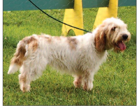
Button was 2nd Unentered Bitch and Reserve Champion Unentered Hound