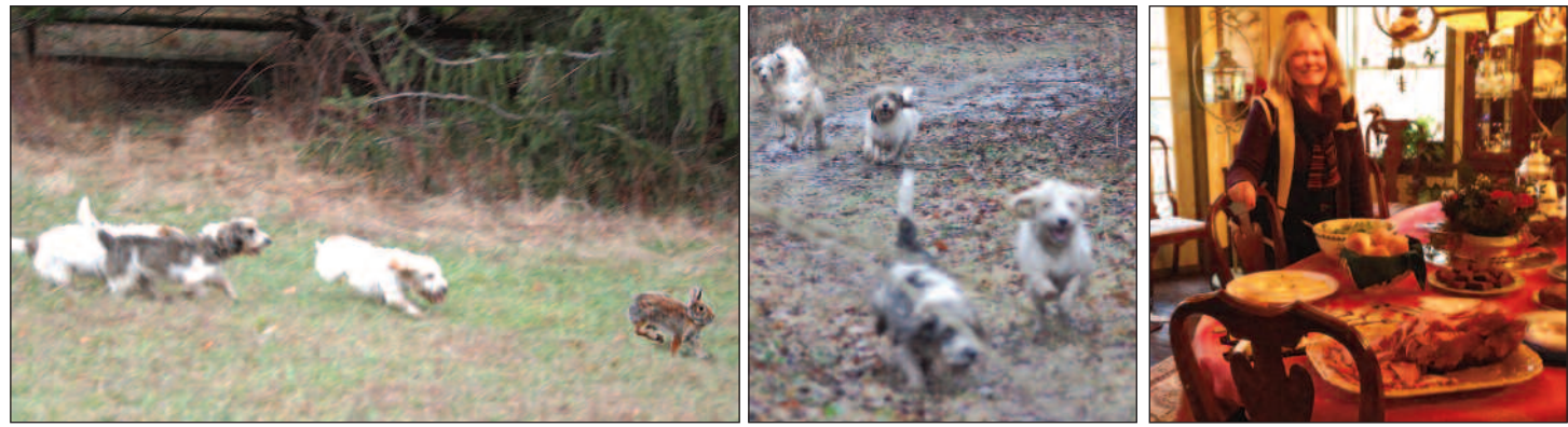
Rabbit out of cover New Year's Day at kennels.

Our New Year's Day morning hunt at Kennels was a fine start to 2016. We began with a draw along the creek cover, where hounds pushed out a huge rabbit that they ran the field edge down to the pond near Creek Road, then back up hill around the main house and to ground in the corner briar patch by the tenant house. They got up a small fresh one and ran it down to the carriage barn and to ground in the tangle in the pines. From there they worked to the west end of the creek line and the upper hedgerow, and the hedge line above Dorlin Mill Road down to the bottom of the hill and back to the hedgerow toward kennels, where Salsa almost caught a quick-to-ground bunny, then led the pack on