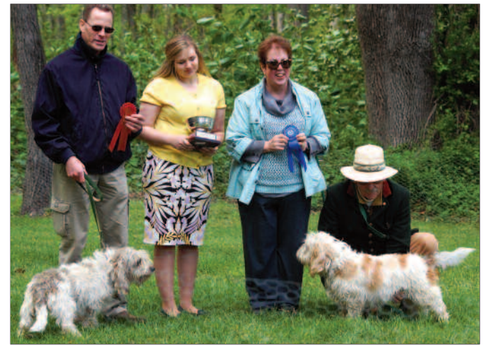
Yarrow, Best Entered Hound, wins the Killen Cup for Best in Show, Ziva, Best Puppy, Reserve.