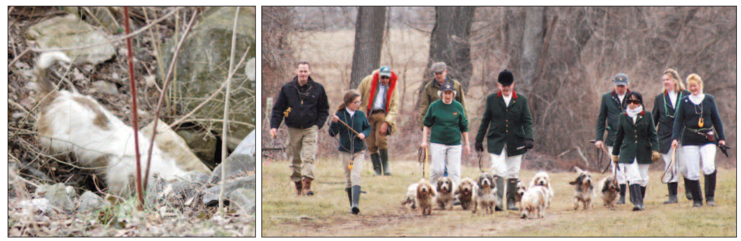
Brandywine-third rabbit to ground!