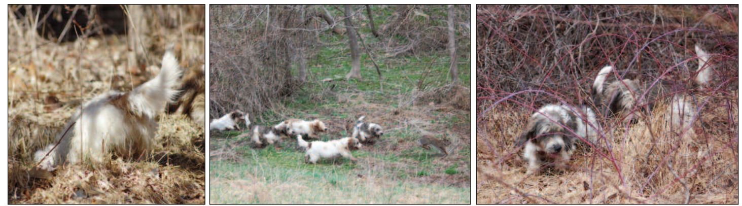
Jefferis's—final rabbit to ground.Cheslen—In cry on their fifth rabbit!Flagg's—first rabbit to ground.hunt. The tea afterwards at the Gross's was grand.Flagg's—first rabbit to ground.

oughly to start, speaking at holes, and got a good run from the far side that they drove to the upper end and back down the near side into the long gully to a check. The rabbit broke out in front of the field and got to ground in the tree plantings. We then crossed to the north hedgerow where hounds worked rabbit 2 to ground in the trash cover, then drew to a find another in the small covert in the middle of the field. They ran it in a loop to cross over to the trash pile cover and to ground. Salsa was head and shoulders into the earth! We then tried the woods toward the road, and hounds worked through along the entry road tangle. I spotted a rabbit sitting in the field edge watching us as we came. Unbelieveably it sat tight until hounds got within five feet of it, then as Quarry and the pack roared it bolted and ran left for a loop across the entry road and back under a parked car into the cover around the towers and to ground, with Souza digging at the earth to finish this exciting