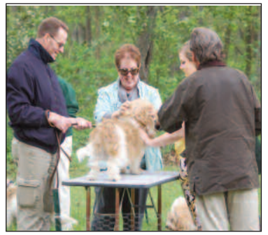
Checking a retiree.