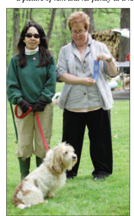
Souza wins Best Entered