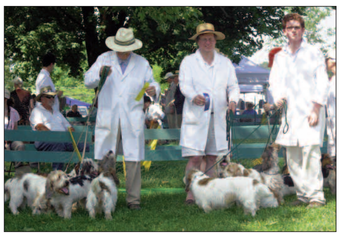
We won second and third in the 2 Couples of Hounds Class