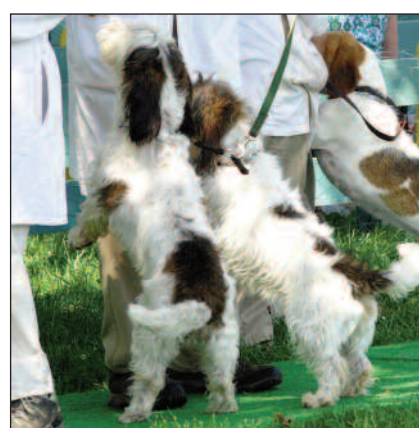
Roguish and Teasel 4th Couple of Bitches