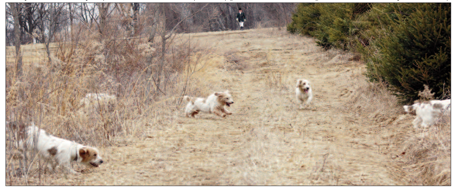
Jefferis's...hounds with their fourth rabbit!

were all short runners, except for the doubling bunny that circled the left woods to the kennels and back to ground. The one Marsha tally-hoed typically found a groundhog hole and dropped in for a quick visit. Most hounds worked well (Roguish, everyone noticed that you were just there for a walk with the Master), even the puppies. Tea at Holly and Dick's was marvelous: two, count 'em, two tables laden with food, port in the butler's pantry, and a view to die for. They take very good care of us and we are grateful!. We walked the pack Wednesday