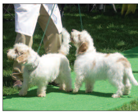
Gallion and Yuengling 1st Couple of Doghounds