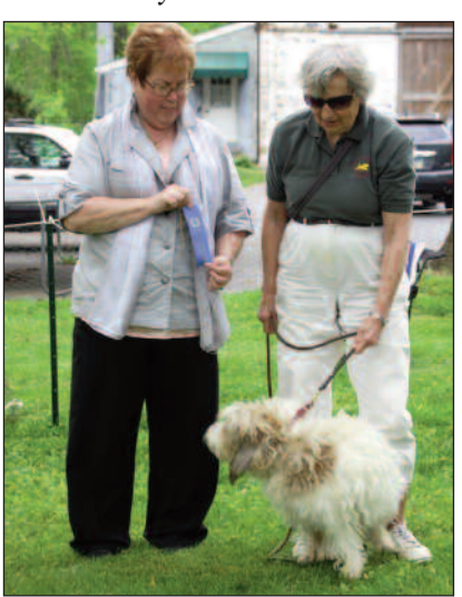
Osprey wins Best Retired Hound