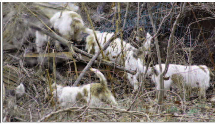
Last run New Year's Day at Church Farm.