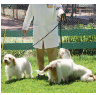
Gallion 2nd Stallion with Get