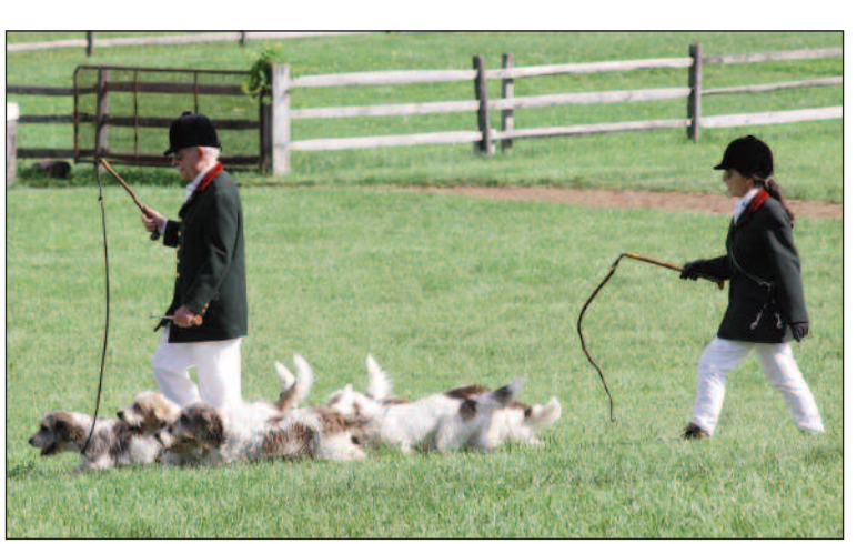
Our Third Place Five Couple Pack