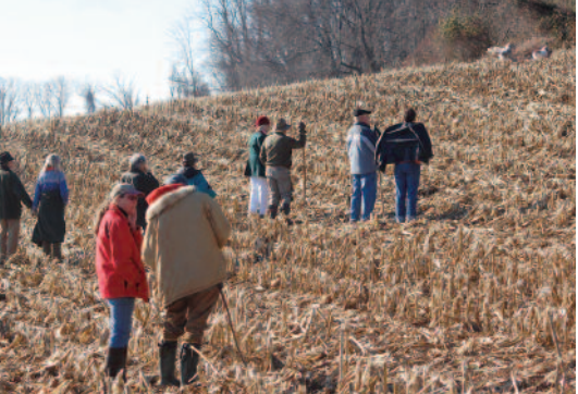
Boxing Day—the Field watching the final draw.