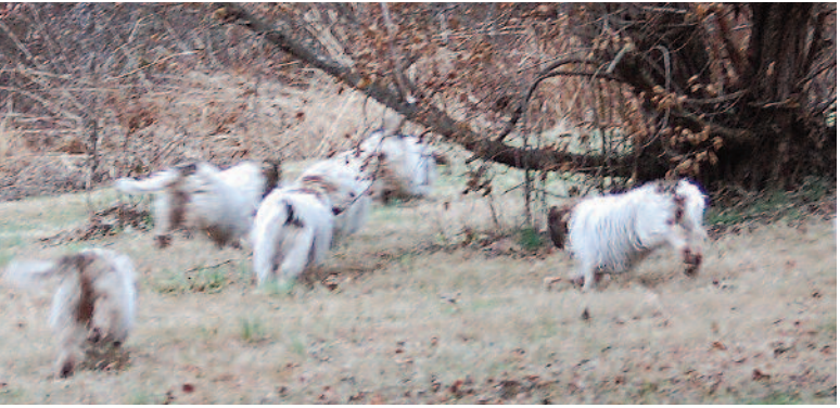
Welkenweir—first rabbit to ground.