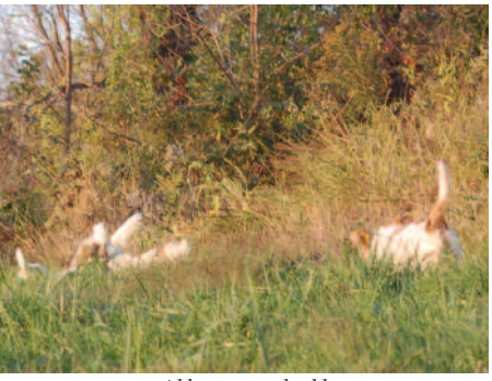
Aldie three couple.

holes to end the day. Sabine, Salsa and Souza were the stars, with young Yuengling working like a pro the whole day. It was an excellent tuneup for Aldie. Everyone had a great time. The tailgate was super with goodies from the party at Suzanne Bender's Saturday night.