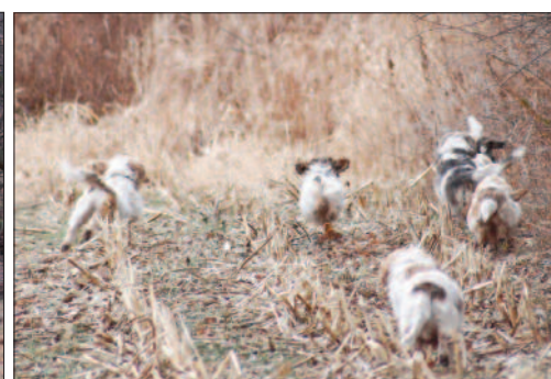
Silberman's __rabbit 2 into the woods