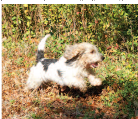
Opening Meet—Push him out!