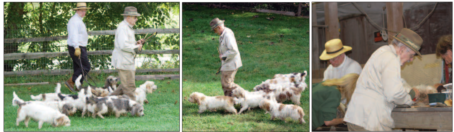
Summer training at the farm—first 4 couple.