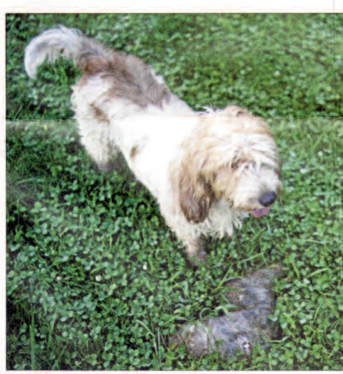
One of Scharnberg's hounds takes a break from hunting.