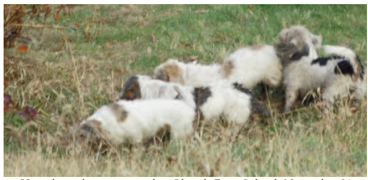
Hounds marking to ground at Church Farm School, November 21.

The training hunt at Harold Hallman's on Saturday November 6th was great. Hounds got up and ran five rabbits to marks in the L shaped cover, the lower field and the long hedgerow at the top of the rise near Theurkauf's. What a difference a day makes. At Sunday's November 7 meet at Bill and Karen Flagg's Warren Point, hounds worked thoroughly in the big woods and pond cover blank, except for a herd of deer. They got a rabbit out for a long burst to ground from the hilltop hedgerow with a good view of the run for the field, then it was a blank the rest of the afternoon through lots of promising cover all atround the upper fields. The tailgate afterwards was great.