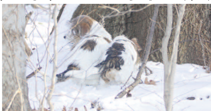
Our pups Victor and Vesper hunting in the snow.

On Boxing Day, Sunday December 26, we met at 10 am at Allerton Farm Gate with a Nor'easter predicted to hit later in the day. The wind was biting already. Hounds found and ran one circling rabbit to ground in the woods covert at the meet, and the field got a great view of a beautiful big fox that broke out in front of them. We drew Parnham's woods edge tangles blank over to the power line cut and worked into the big briar strips on the hillside with an occasional bit of speaking on short to ground rabbits and night lines. A herd of deer moved out as we drew, and another fox came out the bottom strip above the farm lane. Working back up the hill through the strips and over to the hedgerow and patches above Bedwell's, several times hounds spoke briefly and were feathering in several thick spots, but Br'er Rabbit was sitting tight and we finished with a draw through the woods covert at the meet and tucked them into the hay-filled trailer to end the day. The first snow flakes were just beginning to fall. My lips were so numb I could barely blow "home." The hunt breakfast at Josie Parnham's was wonderful. A lot of effort goes into putting together that grand spread, and she and her family are very kind indeed to put it on for us each year.