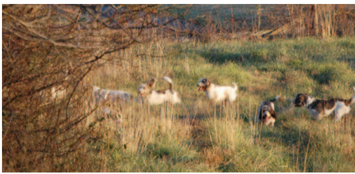
Hounds putting their first rabbit to ground at Hallman's.

Wednesday the 1st December we hunted Church Farm with a training 3 couple—very cold and little scent made it hard to run rabbits in the open, but hounds got up game and worked well the whole time. Saturday the 4th we trained at Marsh Creek. Very little scent and cold and windy. Hounds worked hard to get a couple of rabbits going for short runs.