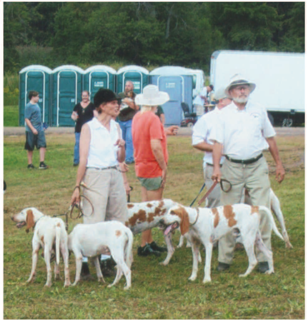
Warwick Village Hunt