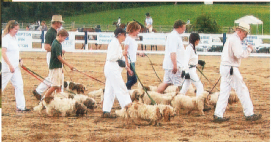
Skycastle French Hounds