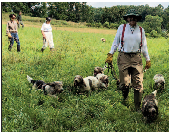
Coming in from hunting at kennels July 22.

patch which had been mowed—there was a track that had been cut near the creek and around the wooded patch. After blanking on the wooded patch, the hounds crossed back to the creek and worked up to the edge of the woods. After working the wooded patch with the chimney to a blank, we thought it best not to press our luck and with our little pack re-assembled, we walked back to the barn and snacks and cooling tea provided by Gillian. Thanks to everyone for their assistance this morning! Sunday the 22nd we had a good hunt at kennels