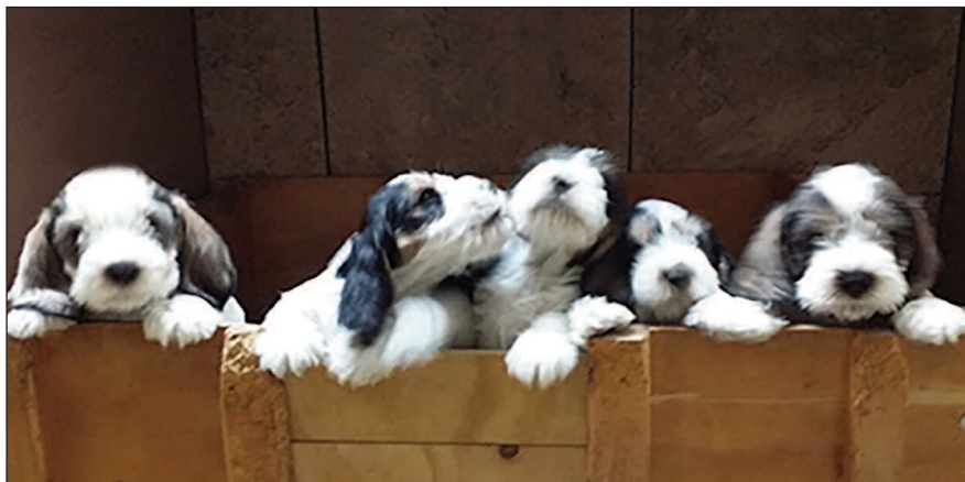
Five of a kind!

with 4 1/2 couple. The newly cut fields made going much easier. Hounds holed the first rabbit at the tenant house, then found and worked a rabbit along the creek hedgerow to ground in the bank behind the carriage barn. They worked out to the end and back, then got up another for a driving hunt toward the pond and road that doubled back and was forced out by Artful for a run up the hill to ground in a big bush cover by the pool. Uwchlan was in the earth to finish there. We drew back through the tenant house hedgerow to finish the morning, and made it through without rain. Deburring wasn't too bad, and Gene's treats and lemonade and Gillian's iced tea were most welcome.