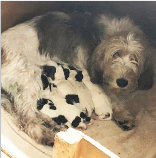
Margot and her 5 pups July 15th.

During most of the month of June we walked and trained at kennels as intermittent rain permitted. We hunted Marsh Creek on the 23rd with a run to ground in the oval and marks along the hedgerows, but with high grass and uncut fields we headed back early to exercise the rest of the pack. We hunted a 3 couple at CFS the morning of July 1st before it got too hot. Hounds put one rabbit to ground after a run in the center stream cover at the start, but that was it. They worked the hedgerows and the corn blank from then on, but found only a solid pasting of burrs! Cleanup at kennels afterward was extensive and Gene, Phyllis and I had out hands full. Gene's iced tea and treats afterward were most welcome. We hunted a 3 couple at Bob Berry's the morning of the 8th in lovely cool 60° weather for a change. Two short runs to ground in the hedgerows, else little action. It was good to get out into burr-free fields for a change, and cleanup wasn't bad.