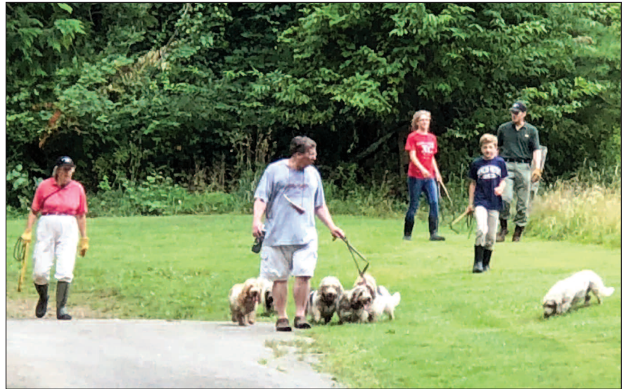
End of the hunt at kennels July 15th.