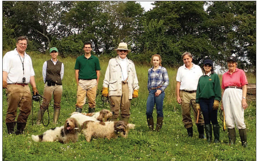
End of a hunt at kennels August 27th.