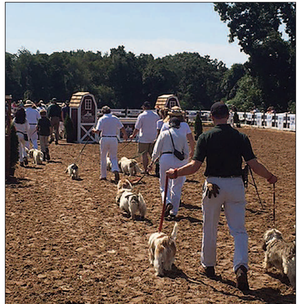
The Ludwig's Corner Horse Show Hound Parade September 4th.