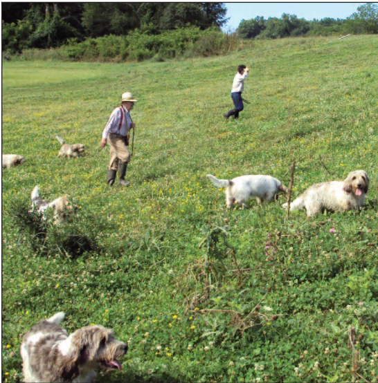
Hound walk July 19th.

The weekend of August 5 and 6 staff exercised the pack while I was away in Vermont. On August 12 and 13, with the bitches coming