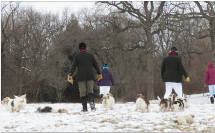
Allerton Farm—moving off.....

underneath digging at the earth. The pack then drew the whole woods, marking and speaking around several holes, and worked out to the eastern hedgerow. After working that from end to the other hedgerow with no further action, we gathered the pack and took them back to