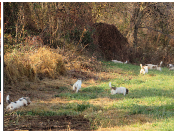
Run to ground at Silberman's.

a happy surprise it was to win the 50% Performance/50% Conformation Coldstream Plate in the 5 couple over 10 other packs! I had an easy drive home Saturday as rain was predicted for the Sunday stake, and deburred the pack without too much trouble. They weren't quite as covered as on our Sunday hunts!