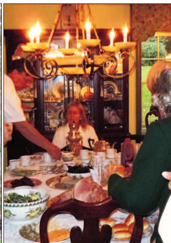
...and tea at Butler's!