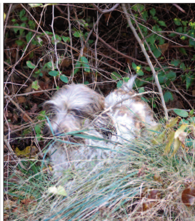
CFS bye day—to ground in stream hedgerow.