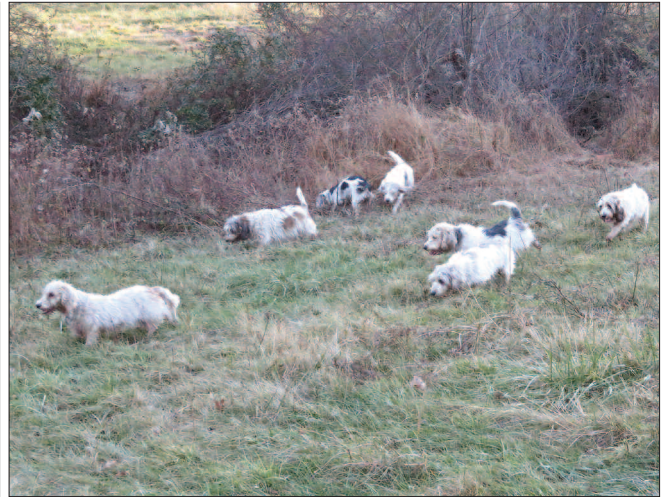
Drawing the stream at the farm..Iroise spots him!