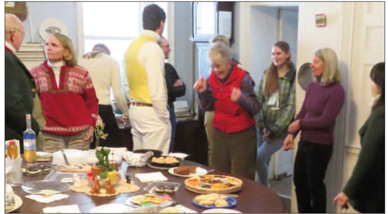
Breakfast at Josie's. What first!?!?

cakes and other sweets. Cleanup of hounds back at kennels afterwards was easy, and we got hot food in them to finish up. It was a happy morning hunt despite the extreme cold—a fine ending to the last formal meet of the old year!