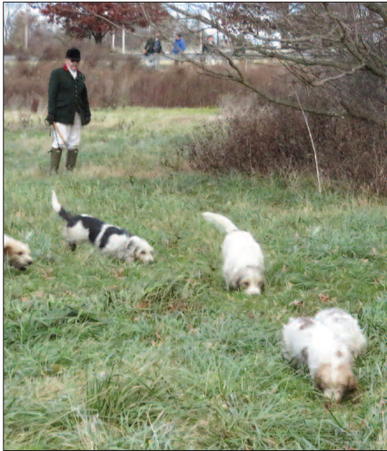
CFS—on the line of rabbit 5....

at the end of the cover to end this rabbit-filled day. Burr clean up was tough. Sunday's hunt at White Acres Farm November 26th was an interesting one. We started hunting the east side with no rabbits. They then worked around the tenant house and down hill to the carriage barn. Drawing the thick stream bank cover, they forced a big rabbit out and ran it in cry for a good long run along the stream and out the upper side for great views for the field. They ran it to ground toward the road in the steep streamside bank above the spring house. The rest of the day was blank as they worked every patch of cover and hedgerow to no avail. Tea at the Boisverts' was great fun. On Wednesday the 29th Gene and I stood out the pack.