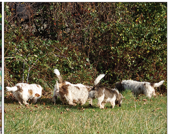
BRCA hedgerow rabbit to ground.