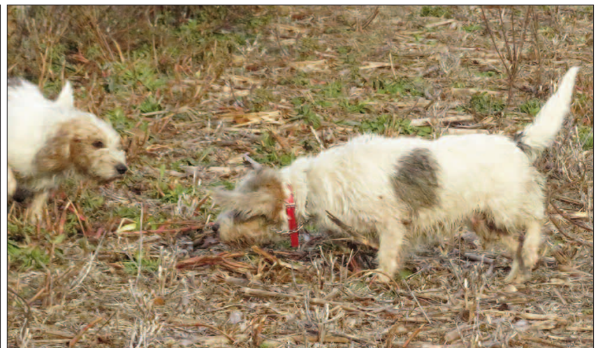
CFS – Artful has the line!