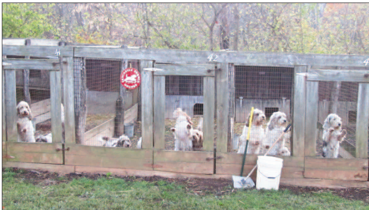
Aldie-hounds in kennels.

and enjoyed their day with us. They brought a lot of children as well, which was great. Beforehand, they were very interested and asked a lot of good questions during my talk about our hunt and what they were going to see. The hunt was a good one, with three good runs to ground and plenty of cry from hounds during the runs. Irmine, Sousa and Salsa were outstanding finding rabbits in the heavy hillside and bottom cover. At the finish Irmine had to be driven out of cover from the last earth. It was very warm and not as brutally hot as the last time there, but we all were glad to get back for the refreshments afterward. Wednesday October 25th, Gene and I walked hounds and did some packing at kennels in preparation for the Aldie trip.