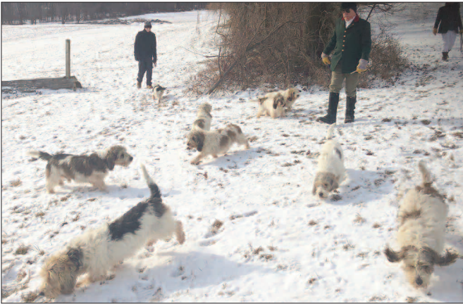
Allerton Farm—crossing to hedgerow 2.