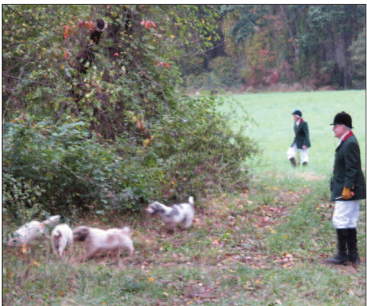
Marsh Creek—into cover.

oppressively hot and humid. The showers held off, but rabbits were scarce. Hounds worked hard to get two moving in the hedgerows that got quickly to ground. Then they found a good runner in the "Sycamore Seep" that they ran the length to the far woods trail to ground in the drain under the trail. They then worked back through the far field edges and the stream cover blank, and we called it a day. At the Myrick Center plenty of cold drinks and sandwiches and sweets were most welcome. Marsh Creek on Sunday the 15th was a cloudy, cool and damp day. Hounds to start found one rabbit for a doubling run along the right side of the track oval to ground at the far corner, then worked the far side thoroughly, putting a short runner to ground on the way to the trail corner. Uwchlan ran the trail downhill heads up with no view, with the pack following working the sides. He gave me good reason not to take him to the Aldie field trials. I called them back and they worked the south side with one short burst to ground, then drew the center hedgerow across the big fields. They drew inside and got a rabbit going, running