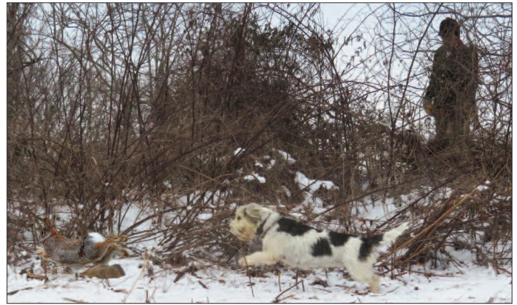
.....and running the rabbit to ground in the upper woods!