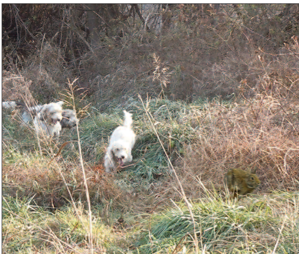
Hallman's—in cry on rabbit 1....