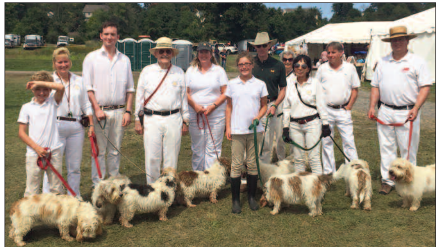
The Ludwig's Corner Horse Show day.