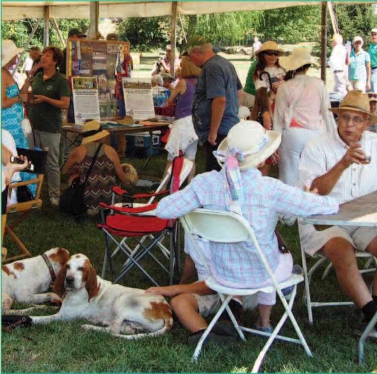
Warwick Village Hounds