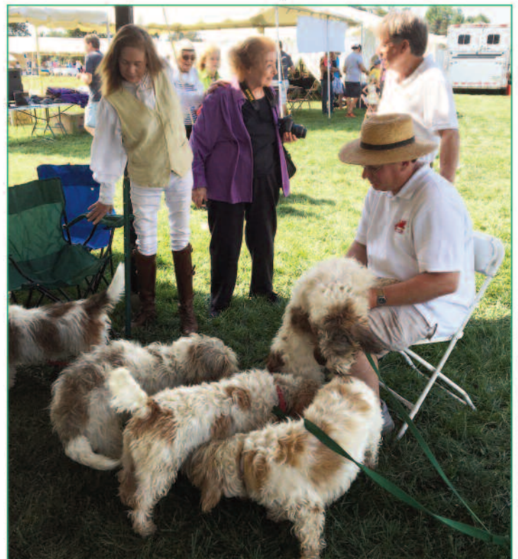
Skycastle French Hounds