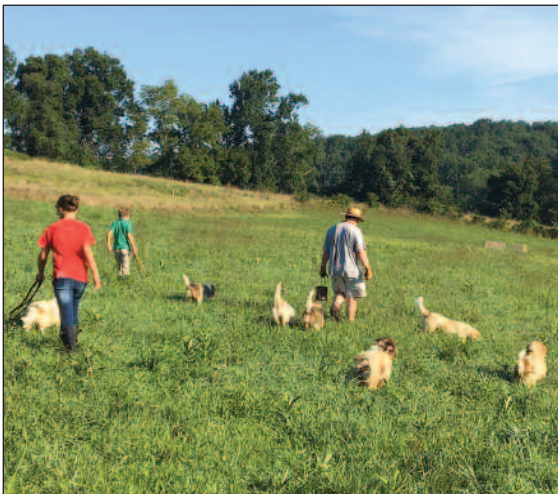
Summer hound walk at kennels.