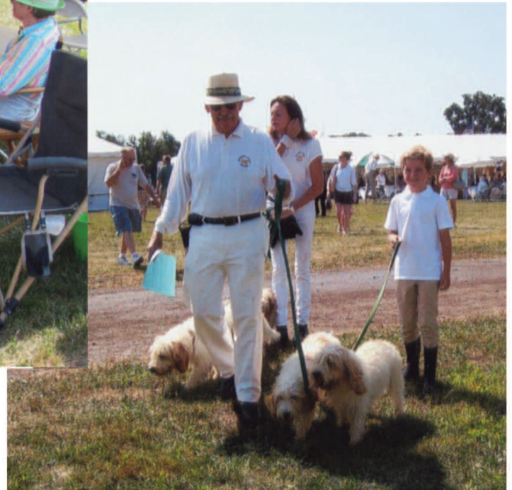
Skycastle French Hounds