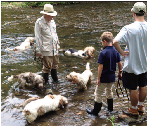
Coolong off after hunting.