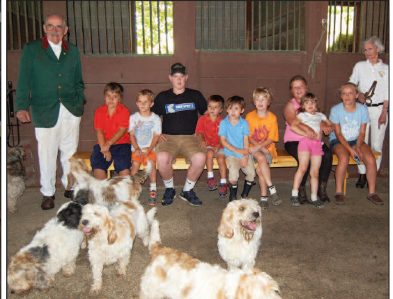
A talk at the Andrews Bridge Foxhounds kennels about bassetting, landowner relations and conservation in Chester County