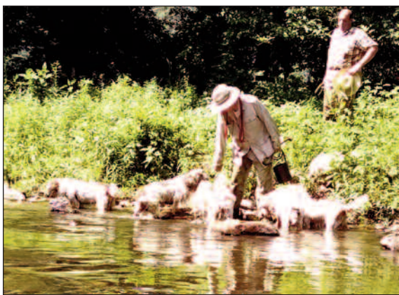
A dip in the Brandywine.