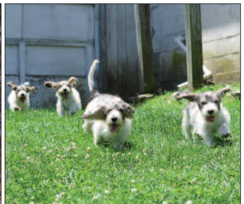
Here come the pups!