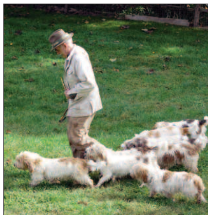
Second 4 couple.