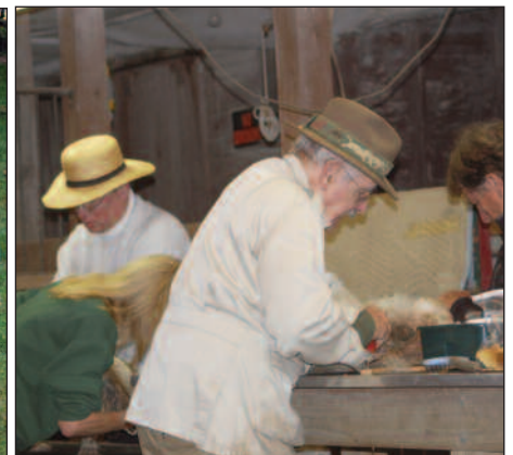
Deburring — the price of rough coats!