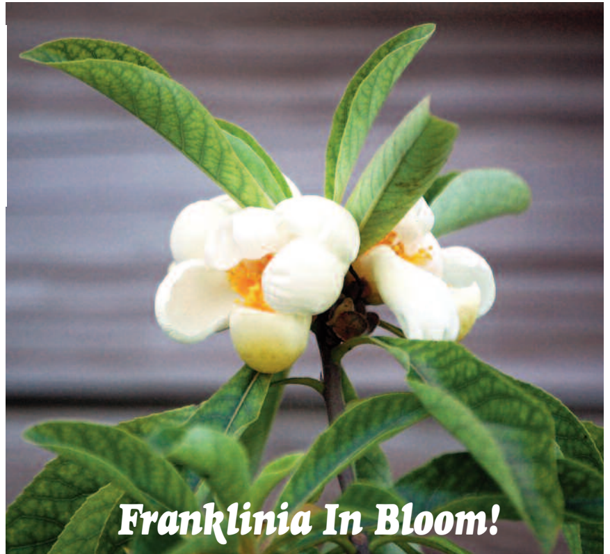
Franklinia In Bloom!