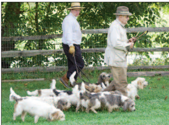
Summer training at the farm—first 4 couple.