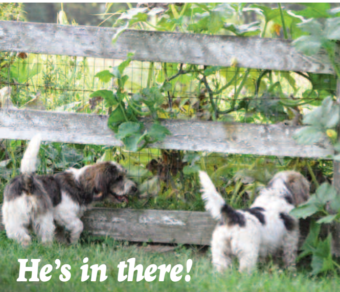
He's in there!