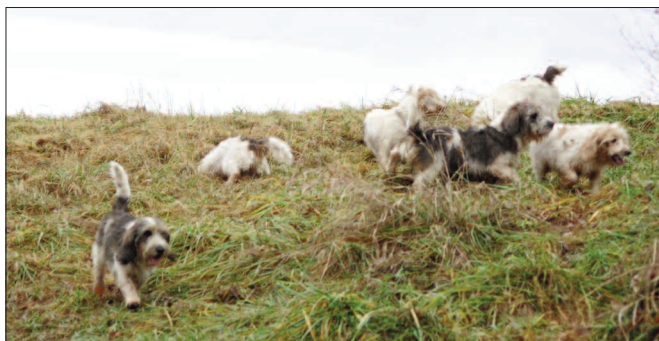
He's to ground—let's find another!