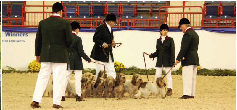
Pennsylvania National Horse Show