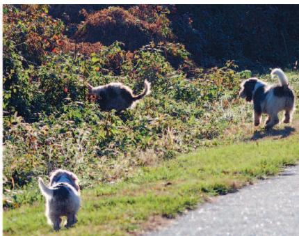
—and to ground!