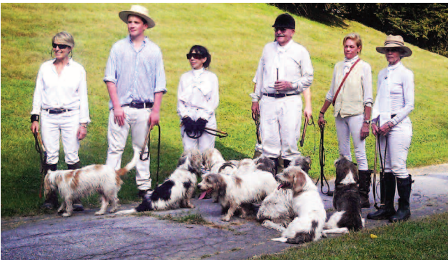
Opening Meet—End of a hot day.