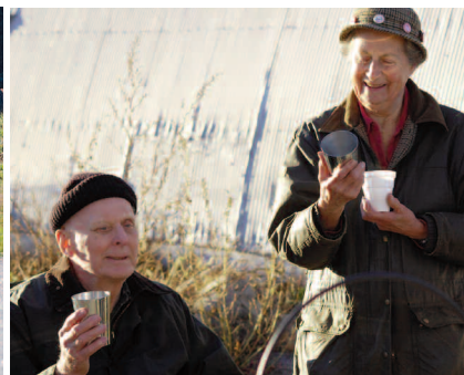
The Wiedorns with their cups