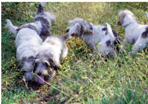
First rabbit to ground.