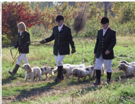
End of day.