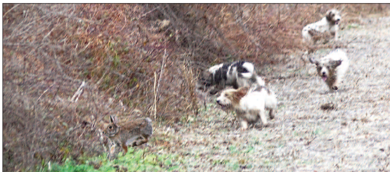
Rabbit in and out along the hedgerow—young Yeoman right on!