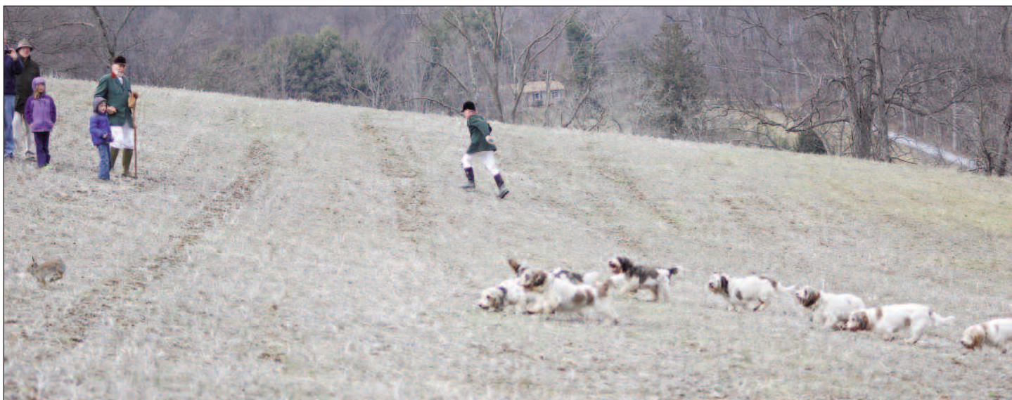
White Acres Farm.....hounds with their first rabbit!