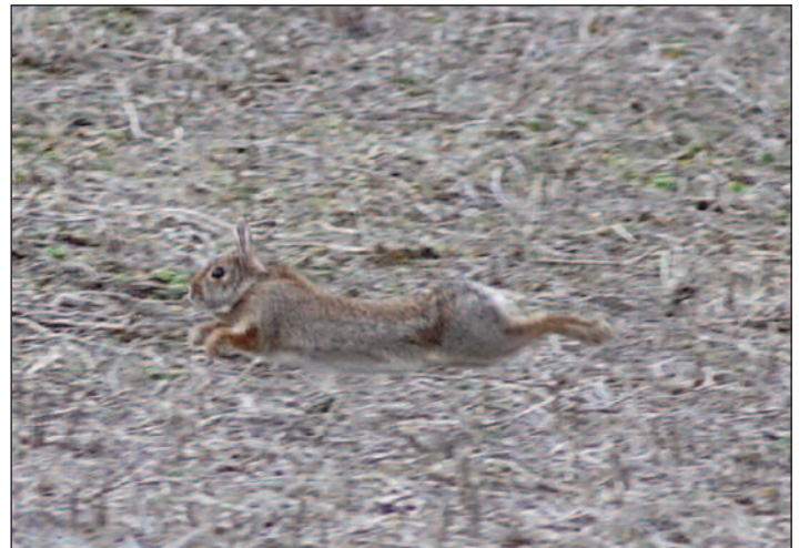
A fast Cottontail at Kennels!