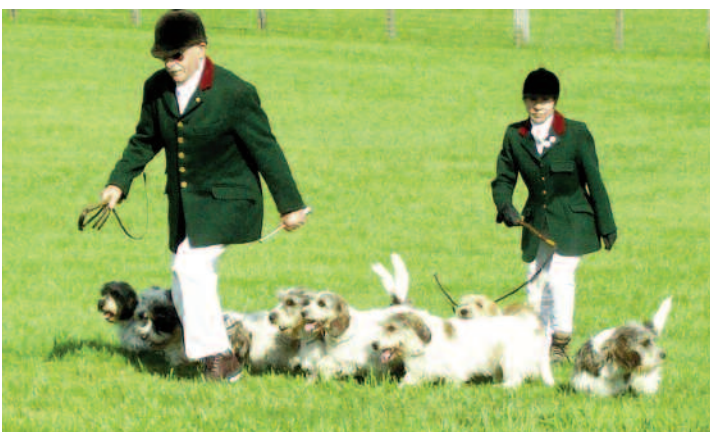
Our Five Couple Pack....