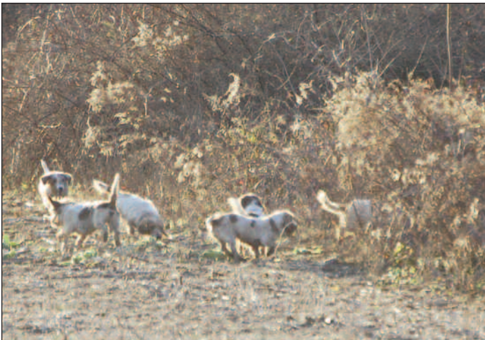
Driving a rabbit at Church Farm