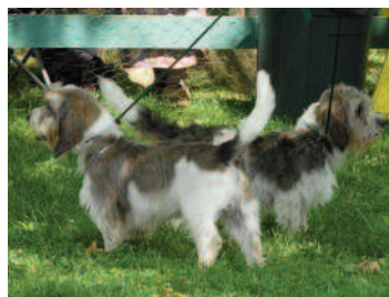
Couples—Larry and Uwchlan