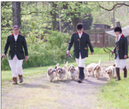
Aldie Three Couple...