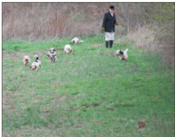
A double back...