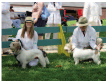
Winsey and Wagtail....