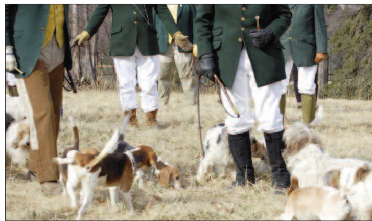
Joint meet with Ardrossan at Welkenweir