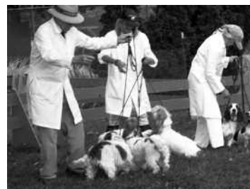
Couples—Roguish and Teasel