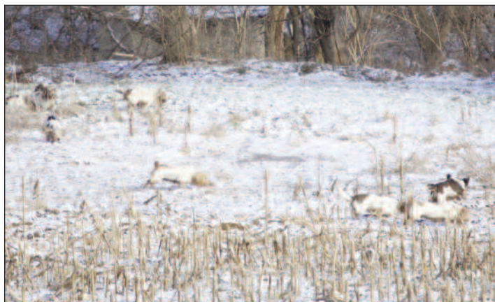
Working a double at Allerton Farm