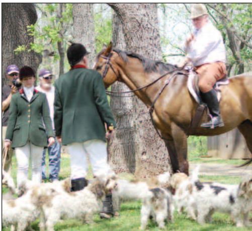
Five Couple moving off...