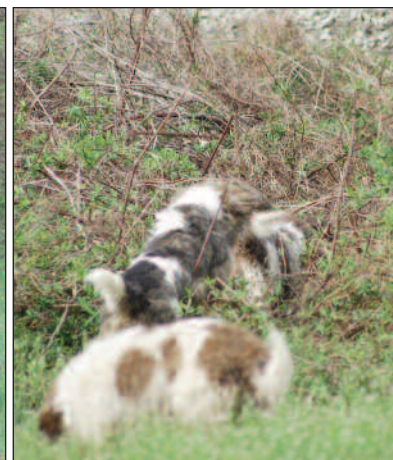
Down the hole!