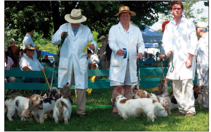
We won first and third in the 2 Couples of hounds Class