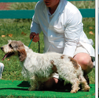
Trompette 2nd Brood Bitch