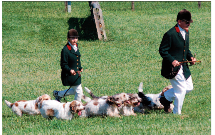
Our Five Couple Pack placing Second