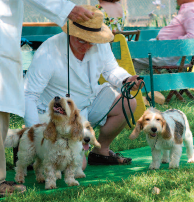
Souza 3rd Brood Bitch with Produce